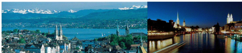
From analysis to implementation